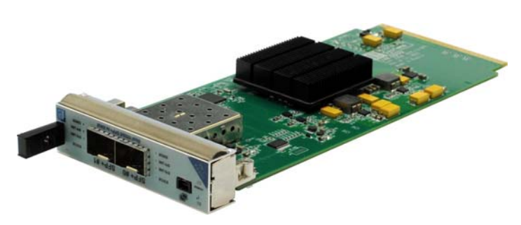
T/AX-DSFPX Network AMC Module